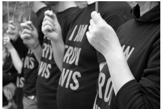
Above: Amnesty International members showing solidarity with Troy Davis.

'I believe that everyone has the potential to improve and correct themselves. Therefore, I am optimistic that it remains possible to deter criminal activity...without having to resort to the death penalty.'