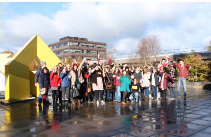
Amnesty Youth members at the Galway Youth Conference, 2nd November 2012

To start a youth group in your school or town and receive a free information pack, please contact us at: hre@amnesty.ie