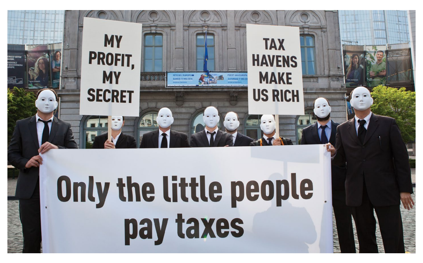
Campaign action during the European parliamentary elections urging companies to pay their taxes.